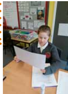
KS2 Bubble working hard in school this week and also enjoying some yoga to relax and unwind.