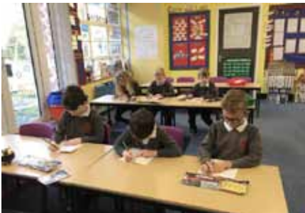
Two photos of children in KS1 bubble working in RWI and reception children in KS1 bubble working on fine motor skills.

Robin class have been reading about the European Mountains. Children were then asked to underline words that they didn't understand and then either use a dictionary or online dictionary to find the definitions. After writing them up the children submitted their work via teams.