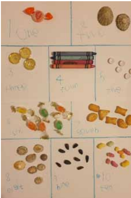
Year R - Magpie Class